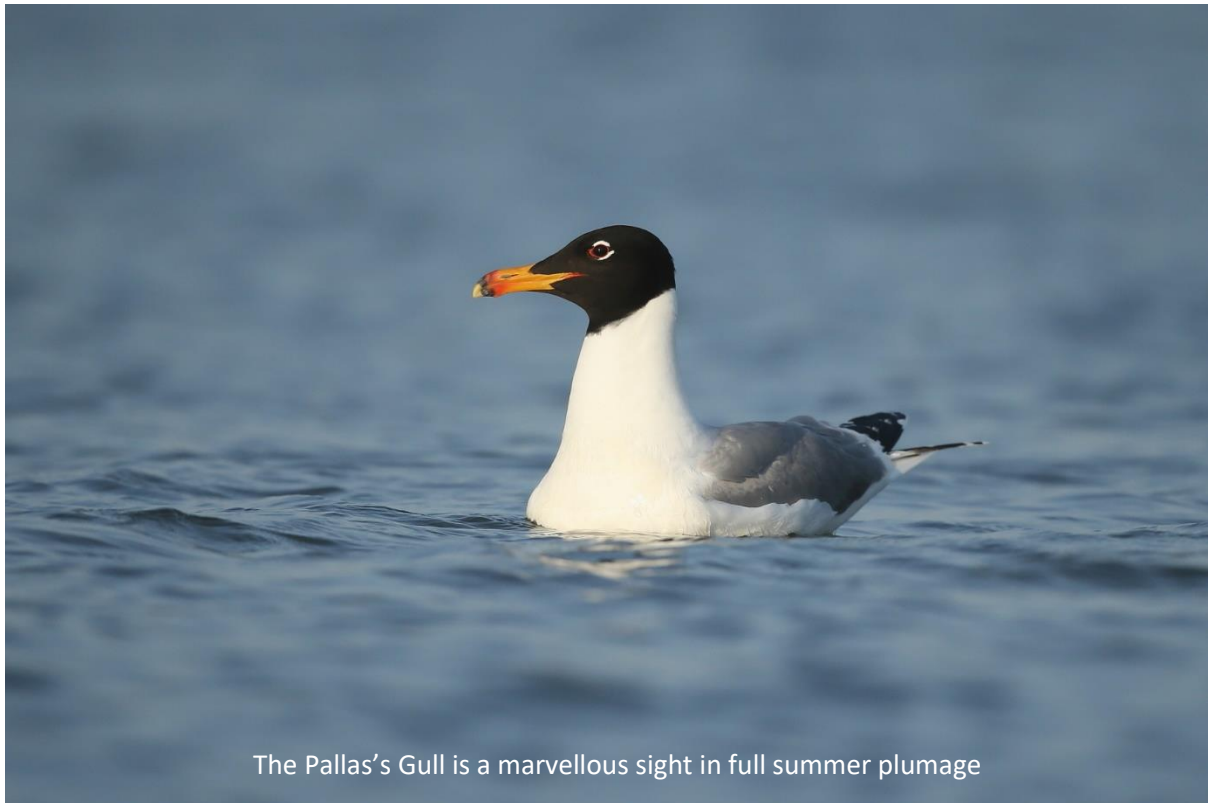
The Pallas's Gull is a marvellous sight in full summer plumage

Sinoe lake is a classic site for waders, terns and pratincoles with a high chance of locating the beautiful Pallas's Gull, a superb adult being shown below. This large 'black-headed' gull is a very rare breeding species with almost mythical status in Western Europe. Here and later in the delta we have good chances to find them.