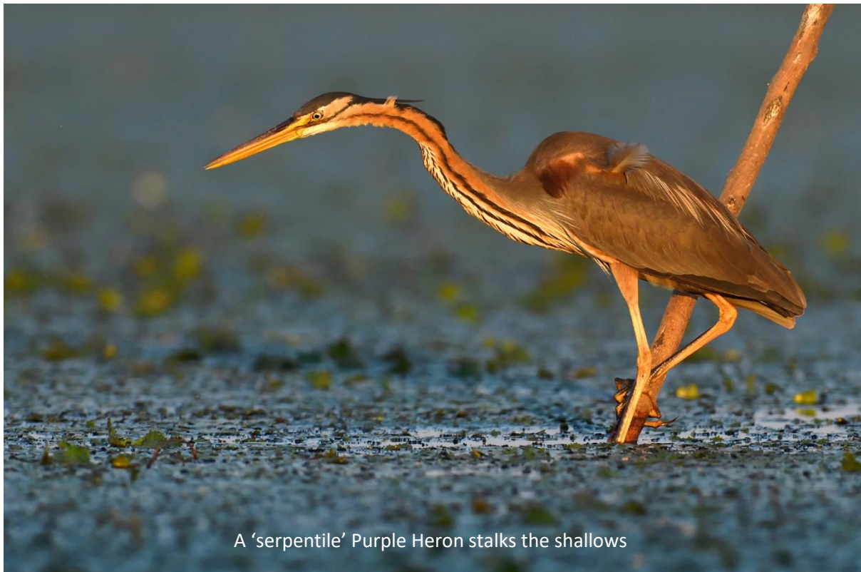
A 'serpentine' Purple Heron stalks the shallows

Our flights from the north and south of the UK are scheduled to arrive at Bucharest airport mid to late afternoon where we rendezvous as a group. After meeting our guide and local driver, we head east on a three-hour drive to the Black Sea coast and our rural accommodation which lies close to the most important wetlands sites. First of four nights near Constanta.