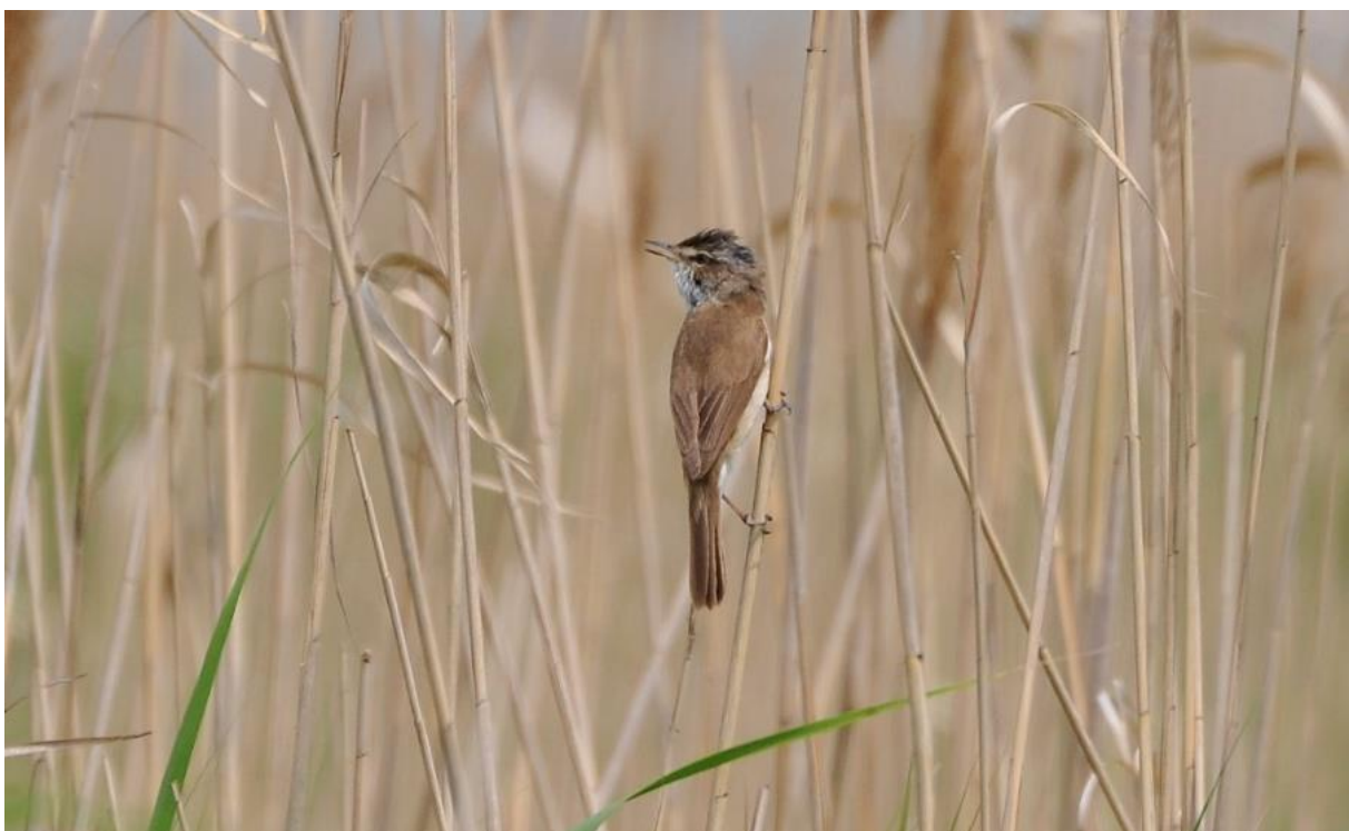
Paddyfield Warbler – soon to depart on its long migration to the Indian subcontinent

Adjacent reedbeds hold abundant Great Reed-warblers and Bearded Reedling as well as the scarce Moustached Warbler. Even more notable are breeding Paddyfield Warblers, the area being recognised as one of the best sites in Europe for this rare species.