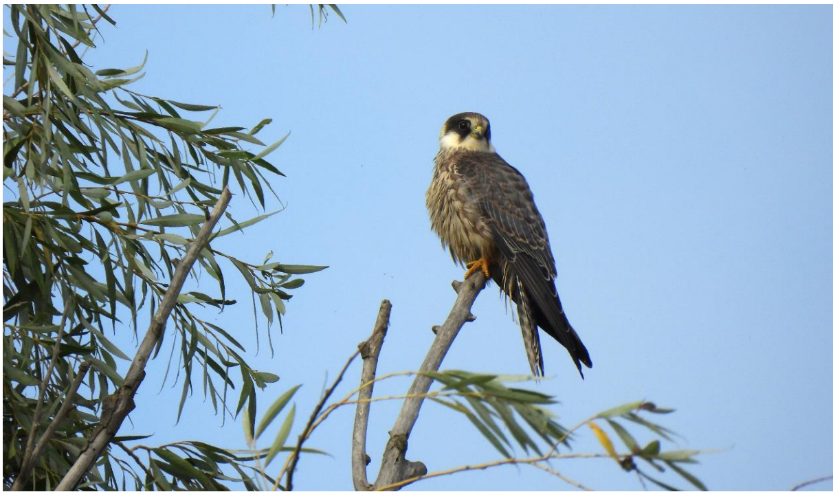
A juvenile Red-footed Falcon. The barred uppertail is diagnostic compared to Eurasian Hobby

building their energy stores for onward journeys. Close-by open oak woodlands host both Grey-headed and Middle Spotted Woodpeckers, and in the late afternoon, bare treetops become the resting place for family groups of Red-footed falcons enjoying the warmth of the sun's final rays.