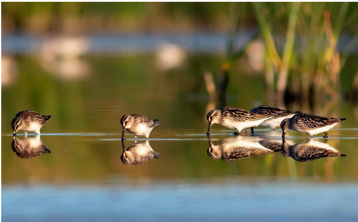
Small parties of Broad-billed Sandpipers pause to refuel on their southbound migration

By spending three nights within the beating heart of this ornithological paradise, we will really get to understand and experience its remoteness and true significance for wildlife. Ferruginous Duck breed here in numbers whilst it is perhaps the best site in Europe to look for Pallas's Gull and migrant Broad-billed Sandpiper in the early autumn.