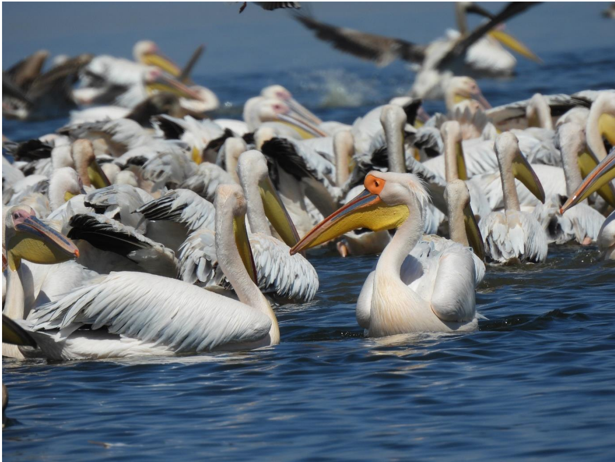
Great White Pelicans feeding on mass. Their pouches can hold four kilograms of fish!

or in small groups, but the Great White Pelicans gather in large cooperative flocks, corralling schools of fish which they scoop up into their large bill pouches. The skill and experience of our boatman will enable us to approach these birds to a close but sensible range, revealing this amazing sight and sound.