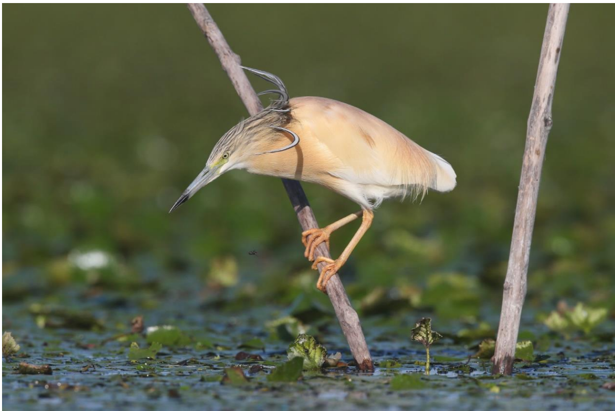
A Squacco Heron waits patiently for its prey

BIRD LIST: Highlights include Ruddy Shelduck, Ferruginous Duck, Garganey, Black-necked Grebe, Alpine Swift, Western Water Rail, Little Crake, Black Stork, White Stork, Common Little Bittern, Great Bittern, Black-crowned Night-heron, Squacco Heron, Great White Egret, Eurasian Spoonbill, Dalmatian Pelican, Great White Pelican, Pygmy Cormorant, Pied Avocet, Black-winged Stilt, Broad-billed Sandpiper, Temminck's Stint, Little Stint, Ruff, Spotted Redshank, Collared Pratincole, Pallas's Gull, Caspian Gull, Caspian Tern, Whiskered Tern, White-winged Tern, Little Owl, Osprey, European Honey-buzzard, Short-toed Snake-eagle, Lesser Spotted Eagle, White-tailed Sea-eagle, Northern Goshawk, Montagu's Harrier, Pallid Harrier, Long-legged Buzzard, Saker Falcon, Red-footed Falcon, Common Hoopoe, European Bee-eater, a host of woodpeckers including Black, Lesser Spotted, Middle Spotted, Great Spotted, Syrian and Grey-headed, Eurasian Golden Oriole, Lesser Grey Shrike, Red-backed Shrike, Crested Lark, Calandra Lark, Tawny Pipit, Sombre Tit, Marsh Tit, Eurasian Penduline-tit, Paddyfield Warbler, Red-breasted Flycatcher, Pied Wheatear, Isabelline Wheatear, Hawfinch.