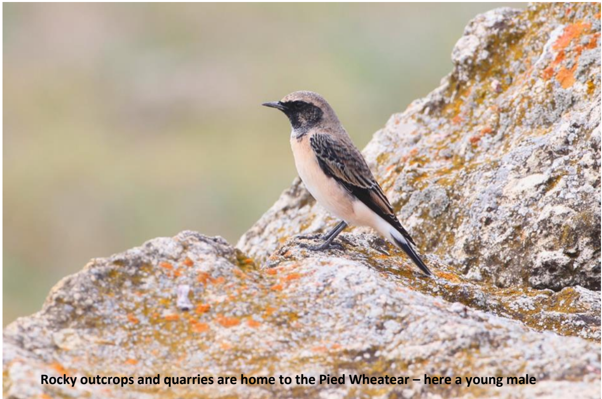
Rocky outcrops and quarries are home to the Pied Wheatear – here a young male

Parts of the Macin Ridge are forested holding similar birds to those further east including the Sombre Tit, and it is here that we make a special effort to locate this target species. The areas greatest value to bird watchers lies in the stoney dry slopes and crags at its western extremity. This is a great area for breeding wheatears, and we can expect more chances for Isabelline, Pied and Northern Wheatears as well as other dry country specialists such as Woodchat Shrike.