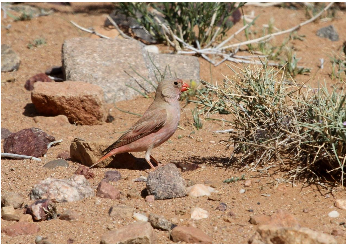
Trumpeter Finches habitually forage on the ground in arid canyons, here a male

River valley. In a landscape characterised by yellow and red canyons, this one is widely regarded as the most scenic and tranquil in the region. Steep walls are formed from ancient sedimentary rock, shaped over millennia by erosion and weathering. A narrow trail follows the course of a former riverbed that once cut deeply through the layers of stone, revealing striking bands of colour and texture along the cliffs. The combination of geological history, natural beauty, and peaceful surroundings makes Angel's Canyon a highlight of this part of Armenia. Close by to the north-west is the Khosrov State Reserve and also the Caucasian Wildlife Reserve, the latter a private protected area managed by a BirdLife partner in Armenia. The whole area abounds with great birding. Overhead we will check for Cinereous Vulture and Short-toed Snake-eagle. Slopes and gullies host an array of canyonland specialists from Chukar, Rosy Starling, Eurasian Crag Martin, Blue Rock-thrush, Rock Sparrow, Eastern Black-eared Wheatear, Black Redstart, Trumpeter Finch and even the scarcer Desert Finch.