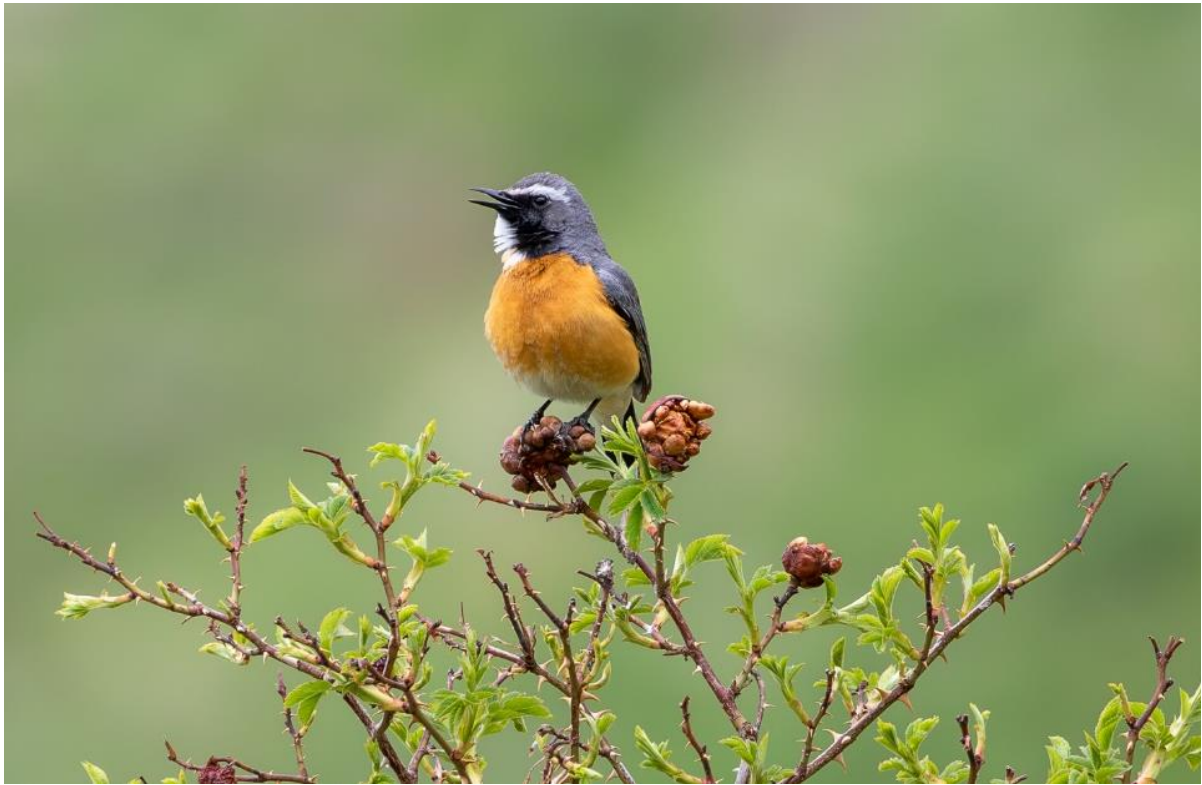
A stunning male White-throated Robin holds territory in a vegetated canyon

cheeked Bee-eater and Menetries's Warbler, whilst tranquil woodlands ring to the songs of Green Warbler, Mountain Chiffchaff and both Semi-collared and Red-breasted Flycatchers. A fabulous selection of raptors, including many vultures and eagles patrol the skies. Our visit coincides with the advancement of spring, when breeding birds will be at their best, so Armenia is bound to produce a tapestry of natural history as rich and enduring as its cultural heritage.