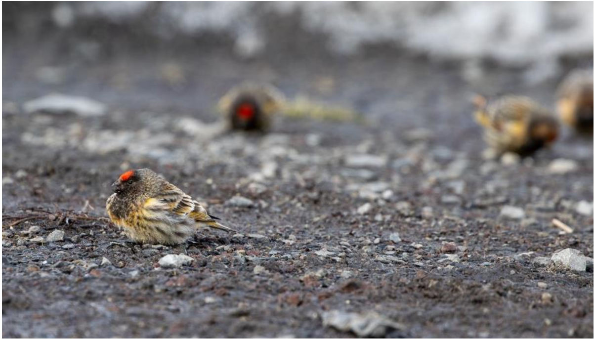
Red-fronted Serin (top) and Rufous-tailed Rock-thrush (below), both montane birds

almost 'diver-like' cry that should help guide us toward their favourite positions on prominent rock ledges among the boulders. Skittish and wary, we will admire these range-restricted birds from a respectful distance. Overhead, both Golden Eagle and Bearded Vulture patrol the ridgelines, looking down onto steep flower-rich meadows and wooded ravines. Grey Partridge and Common Quail favour the grassy slopes, whilst Rufous-tailed Rock-thrush, Water Pipit, Alpine and Red-billed Chough, Red-fronted Serin and Eurasian Crimson-winged Finch all frequent their various niches amongst this montane terrain.