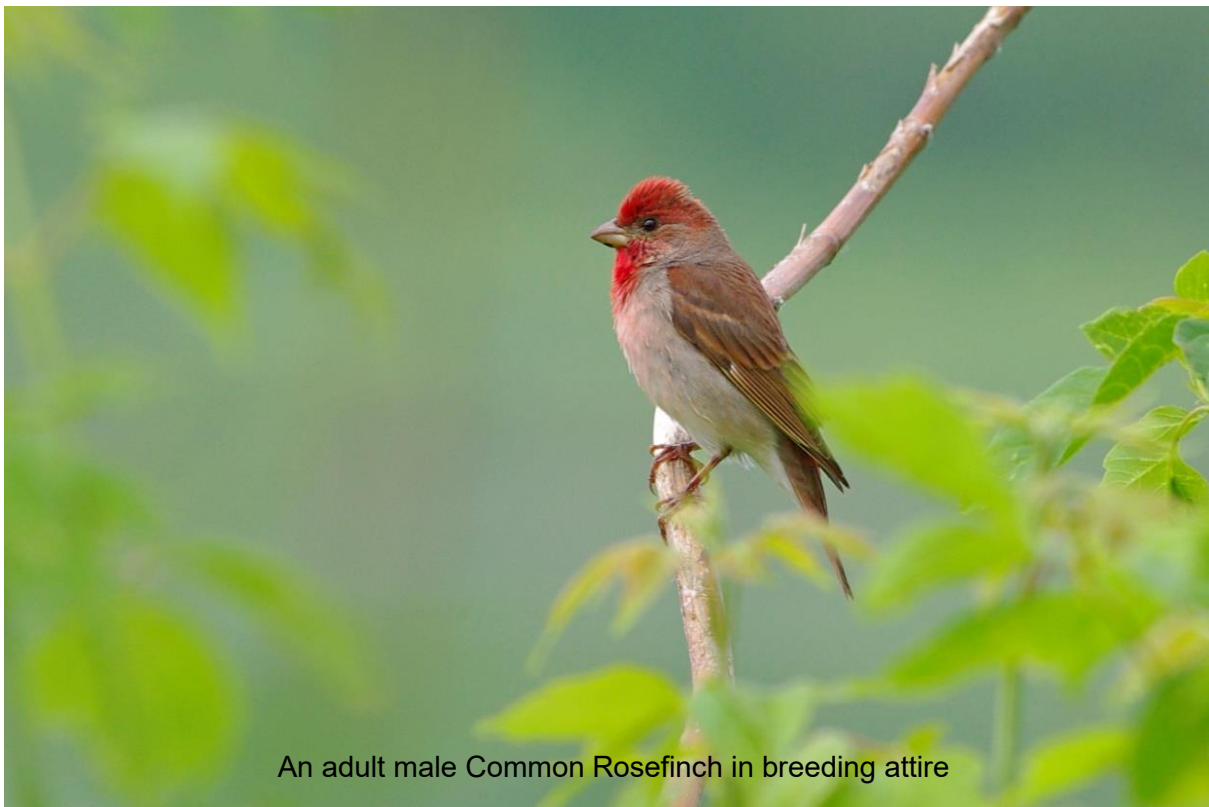
An adult male Common Rosefinch in breeding attire

Retracing our route back through the glorious Armenian countryside, we should be on the lookout for Rosy Starlings. A valley bottom road to Zedea is another excellent birding site where Common Rosefinch sing and Black-headed Bunting are seemingly everywhere. Both Western and Eastern Rock Nuthatches occur together, presenting us with an interesting and fun identification conundrum. Tawny Pipits favour the flatter ground and Short-toed Snake-eagles often hang in the air above the steppe.