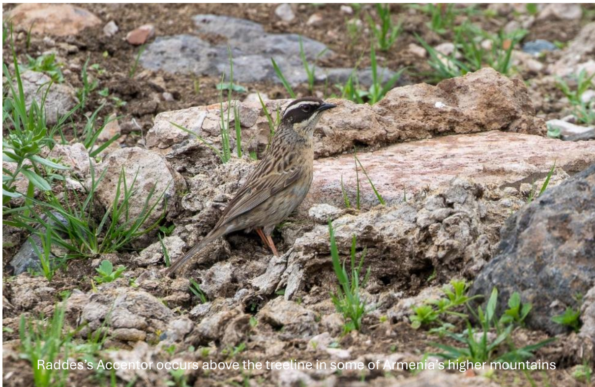
Raddes's Accentor occurs above the treeline in some of Armenia's higher mountains

Biting insects are rarely an issue, though warmer weather around lowland fishponds may encourage some to emerge.