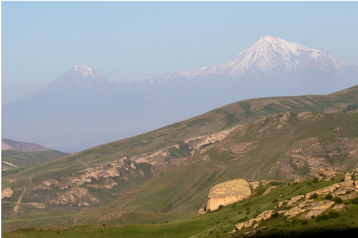
View towards Mount Ararat, often thought to be the final resting place of Noah's Ark