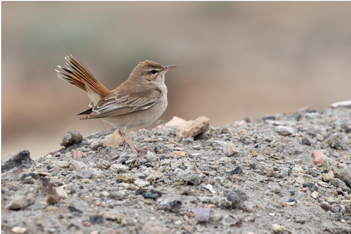
Rufous-tailed Scrub-robin (sub-species syriaca ) in typical cocked-tail stance

The Vedi Hills offer an enchanting mosaic of treeless slopes, weather-worn ridges, and narrow gorges. Tamarisk, wild almond, buckthorn, and sagebrush, all tough semi-desert plants still cling to the stony earth, thriving under the Armenian sun. From a passerine perspective, Vedi is a star location, regularly producing coveted species such as the Rufous-tailed Scrub-robin, White-throated Robin and Upcher's Warbler. Any trickle of water becomes a magnet for thirsty species, including Trumpeter Finch, Grey-necked Bunting and, on occasion, the scarcer Desert Finch. Overhead, Egyptian Vulture and Long-legged Buzzard patrol the skies, and we may even be treated to a glimpse of the rare and powerful Saker Falcon.